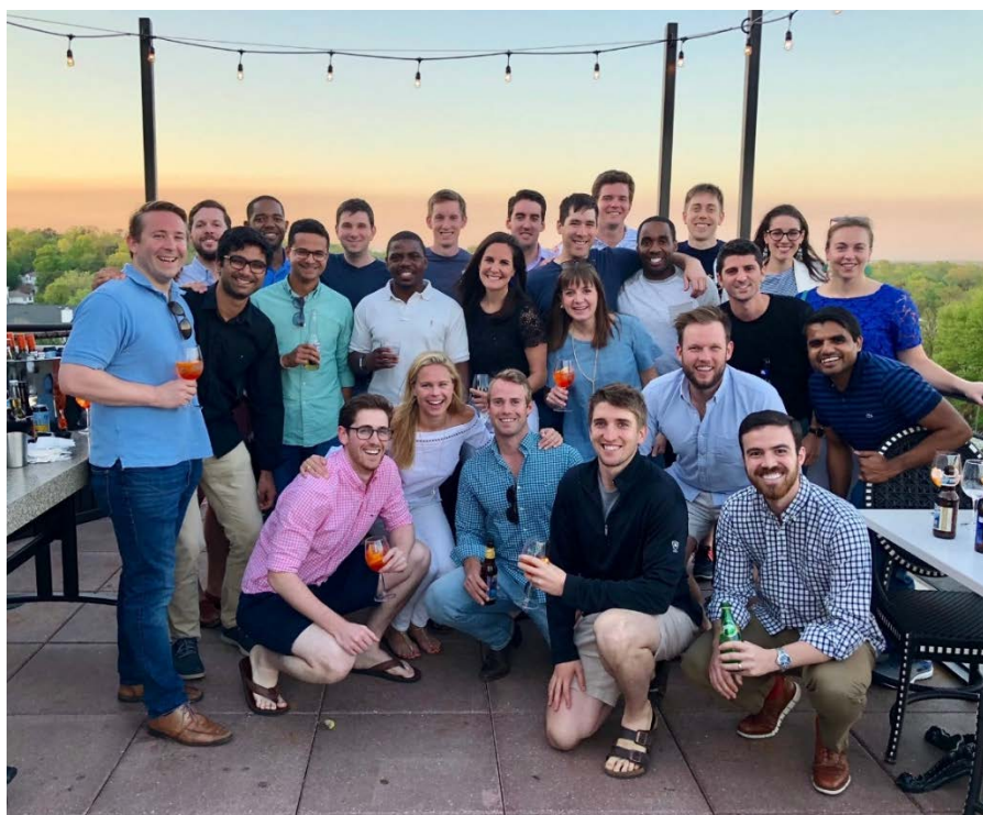
2018 DCM Transition Dinner: Passing the torch from the Class of 2018 to the Class of 2019